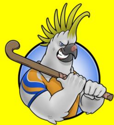
Nigel Cockington Screech III