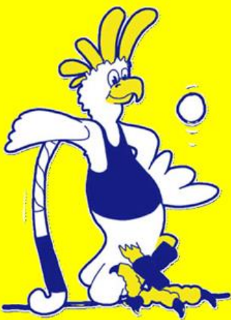
Nigel Cockington Screech I