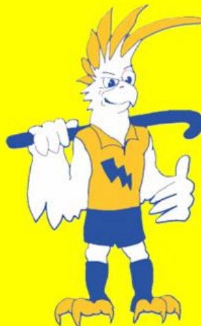
Nigel Cockington Screech II