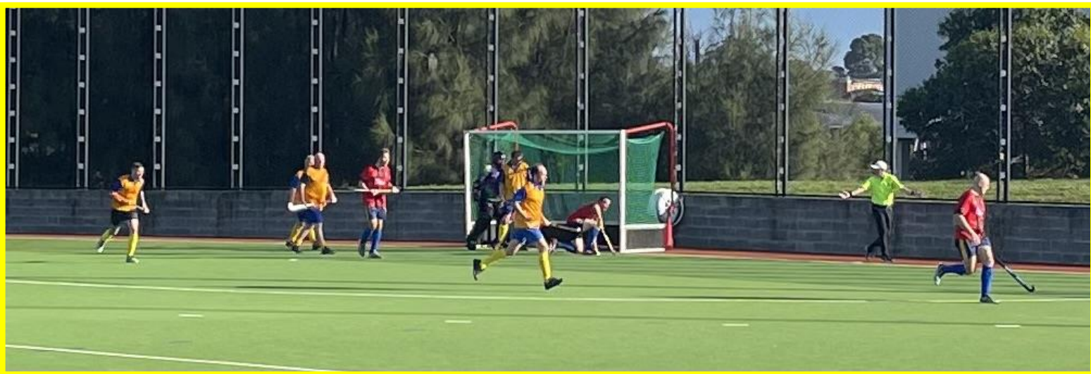
2022 action at the Cintra Hockey Field

Playing Strip. ACT Teams will wear our new 2024 ACT championship strip.