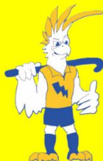
Nigel Cockington Screech II