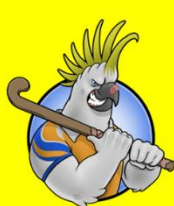
Nigel Cockington Screech III